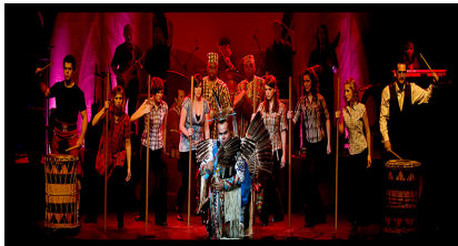
DRUM! ~ DVD