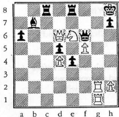
ADVANCED PROBLEM WHITE TO MOVE AND MATE IN 4

In the advanced problem white has control over the g-file but black seems to have ample defenses. Can you find the crushing move to begin this mate!